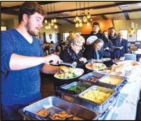
Members line up for a buffet of traditional German food at the Bavarian Bierhaus. Schnitzel, spatzle, beans, red cabbage and other delicious sides were served.