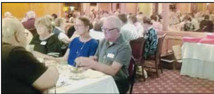
Members enjoying the event.