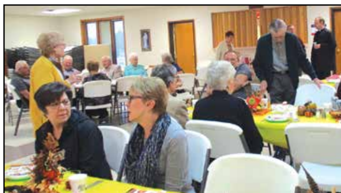
Members enjoy the social hour before the Branch W016 annual fall dinner meeting.