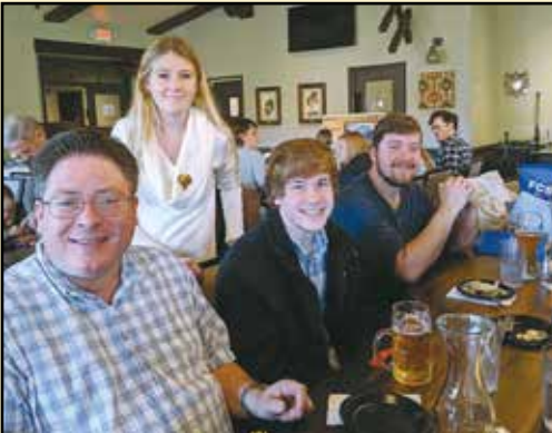
Members of the Muffler family were among the 40 guests at this event.