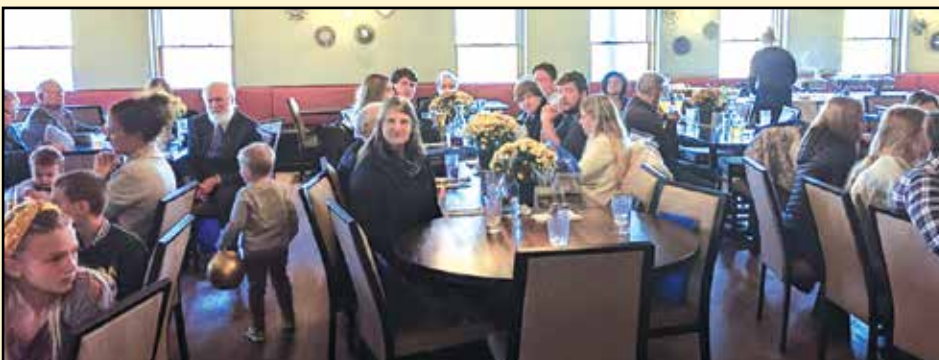
Members and guests of Sr. Branch 23/Jr. Branch 130 gather at the Bavarian Bierhaus to enjoy a luncheon meeting, scholarship presentation and Scavenger Hunt. Over $400 will be donated to the St. Ben's Meal Program as part of a Matching Funds special raffle.