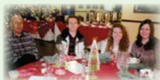
The Pehala Family.