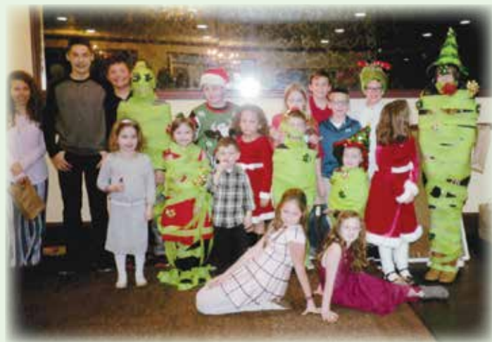
Decorating Christmas trees.