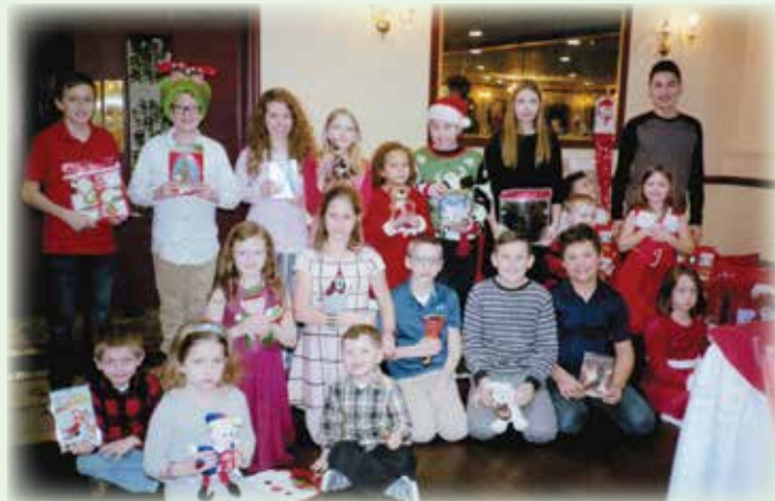
Children with door prizes.