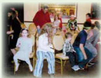
Fun playing Musical Chairs.