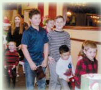
Waiting to play plinko.