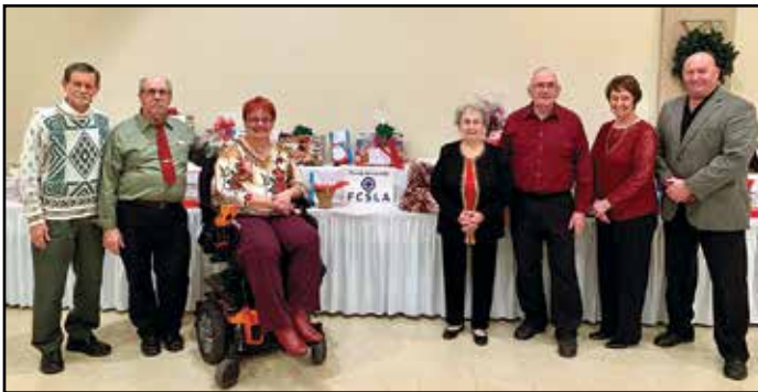
ASCA Officers and Trustees.