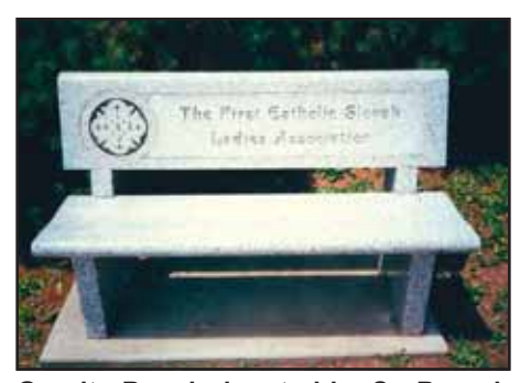
Granite Bench donated by Sr. Branch 172.