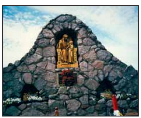
Grotto of St. Ann.

the First Catholic Slovak Ladies Association. Several years ago a granite Bench was donated to the Basilica by Sr. Branch 172 in memory of all living and deceased members of the First Catholic Slovak Ladies Association fraternal society.