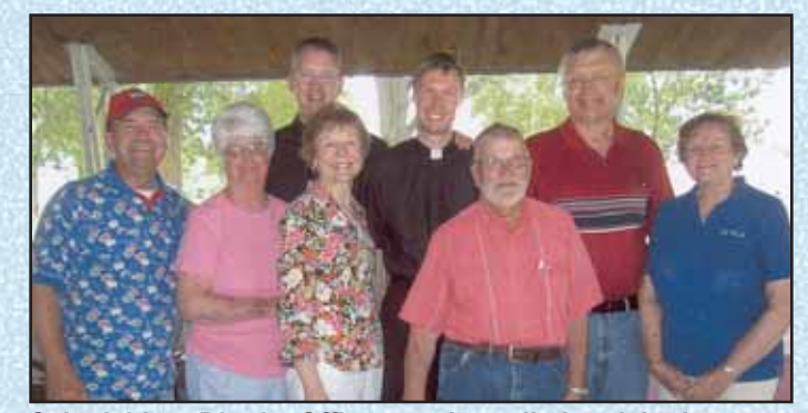
Saint Isidore District Officers and our distinguished guests.