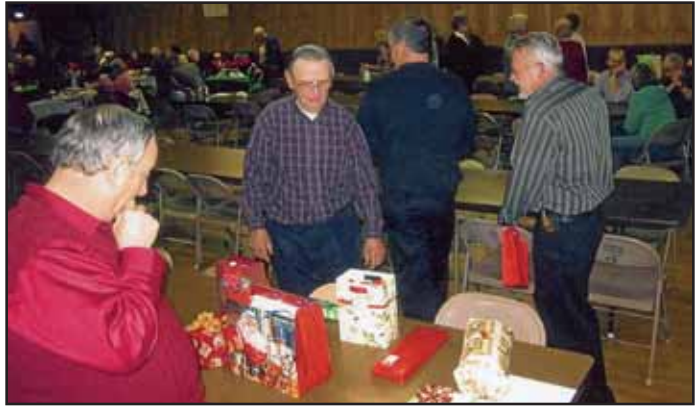
Gentleman survey the "Bring A Gift/Take A Gift" Table.

After the entertainment four special door prizes from the Ohio Office and poinsettia plants were given out as door prizes. Christmas gift exchange was held before everyone returned for home.