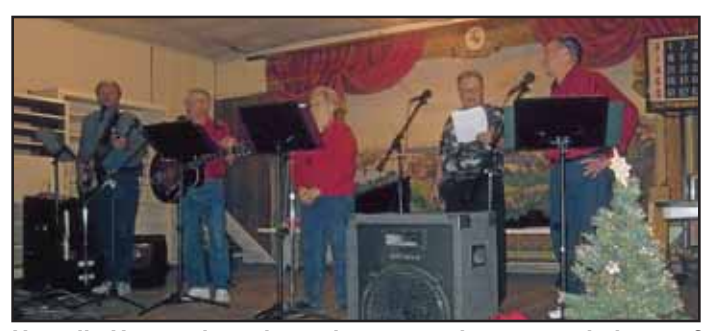
Howells Harmonizers brought seasonal songs and plenty of laughs!