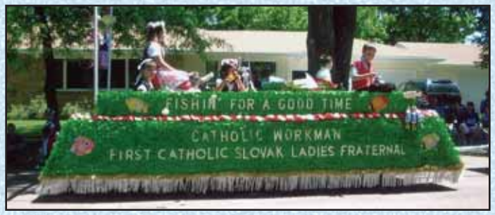
The Branch also participated in Tabor's annual Czech Days celebration on June 18th by entering a float in the parade. This year the branch placed 2nd in their division.