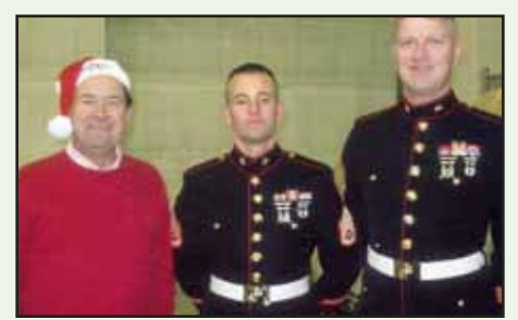
Toys for Tots representatives attending the Christmas gathering.

Representatives of the U.S. Marines were on hand to pick-up the donated toys and a check from the branch.