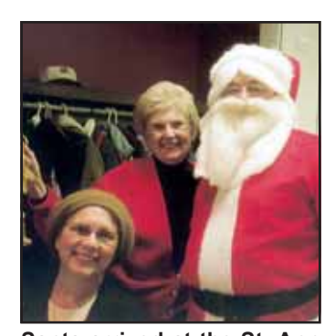
Santa arrived at the St. Ann Lodge Branch 114 Christmas Party in Lorain, OH all the way from the North Pole.