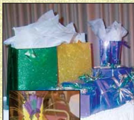
Over 30 door prizes and centerpieces, wrapped in the colors of Mardi Gras, were won by the 104 members in attendance.