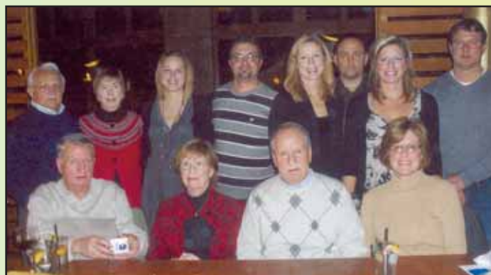
Sr. Branch 177, Clairton, PA officers and new members at their annual Christmas Party.

Sr. Branch 177, Clairton, PA held the annual Christmas Party on Thursday, December 30, 2010 at Nakama on the South Side of Pittsburgh, PA. Officers and new members were acknowledged and a very good dinner was enjoyed by all who attended.