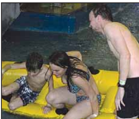
Fun at the waterpark.