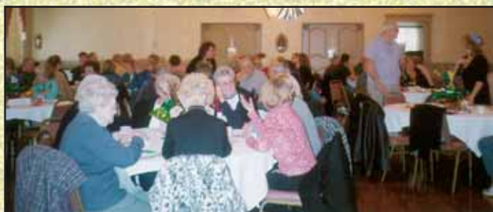
Members of the eight branches which comprise the Youngstown District enjoy "visiting" before the meeting.