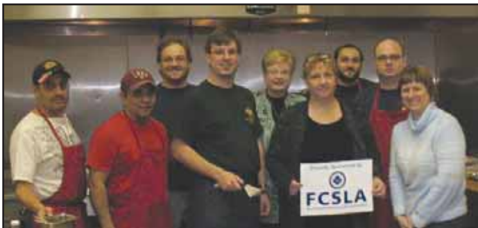
FCSLA and Boy Scout Troop #42 Cooks.