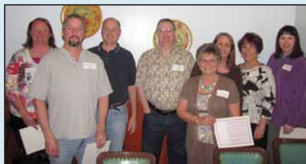
Branch W018 honorees at the 50-Year Luncheon.

Several honorees were able to attend and remarked that they had been FCSLA members since birth. Their loyalty and membership are appreciated.