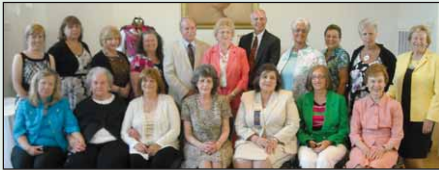
National, Pittsburgh District and Branch 313 Officers who attended the 100th anniversary celebration.