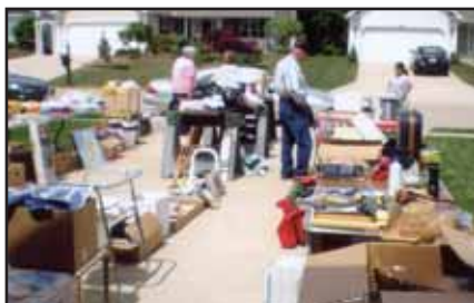
Shoppers at the garage sale, which overflowed onto the driveway.