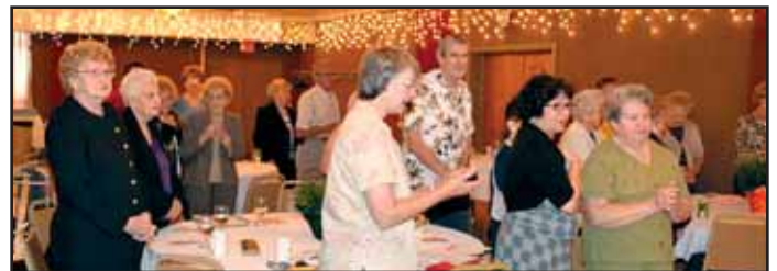
Members of the Eastern PA District enjoying their delicious meal, and standing to recite the Pledge of Allegiance.