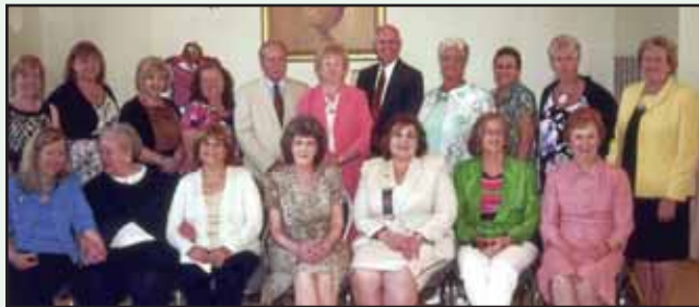
Branch, District & National Officers.