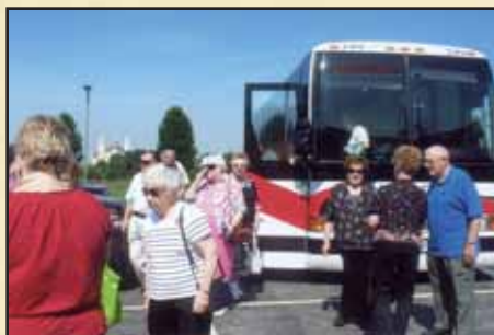
Members seen departing a bus that arrived carrying members from the Wisconsin District.