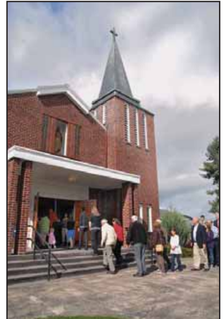
Parishioners line up to enter St. Wenceslaus Church in Scappoose.

Parishioners support and operate a food bank, contribute emergency funds to neighbors in need and serve a Thanksgiving meal to the entire community. Once a month, parish volunteers provide a meal to a men's shelter in Southeast Portland, a project started in 1998 by parish youth that has continued. The parish is home to Branch W139.