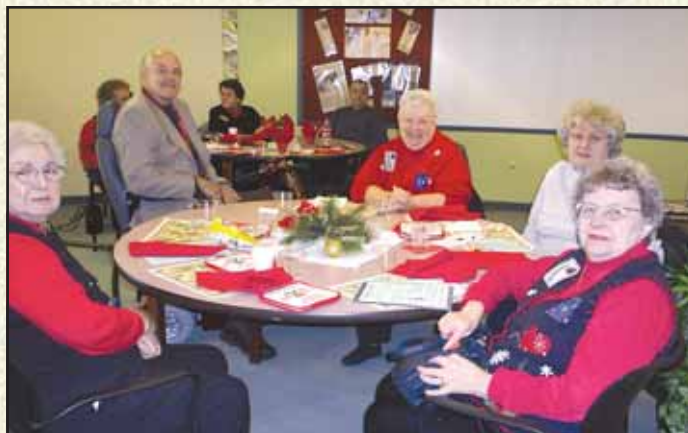
Branch Officers attending the Okres Meeting which was held the same day as the Christmas party at Light of Hearts Villa.

residents of the Light of Hearts Villa in Bedford, OH. In preparation for a festive Christmas season, many FCSLA members had helped decorate the Villa on the Saturday before the party.