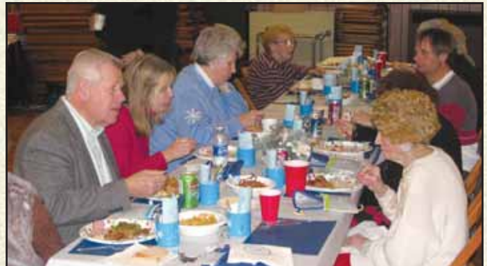
Members enjoying the finely prepared meal.