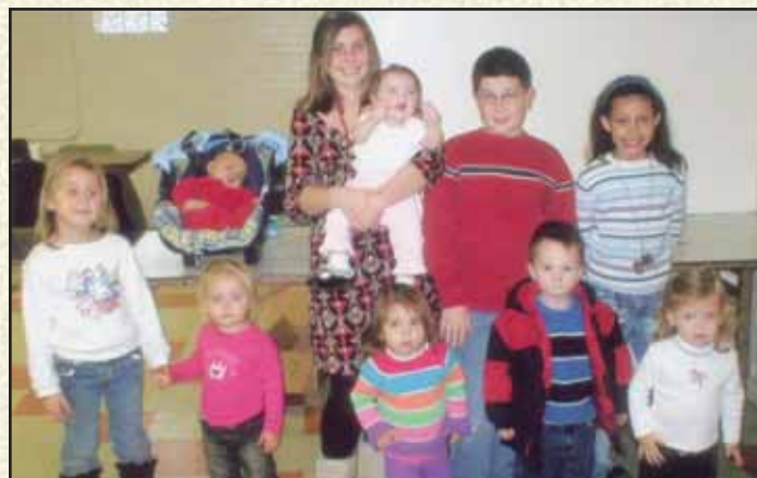
The entire membership of Jr. Branch 11.

semblage. This beautiful woman was deservedly given a large 'round of applause' for her accomplishments.