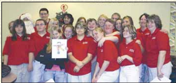
Elyria High School Accelerated Signers with Flat Stanley.