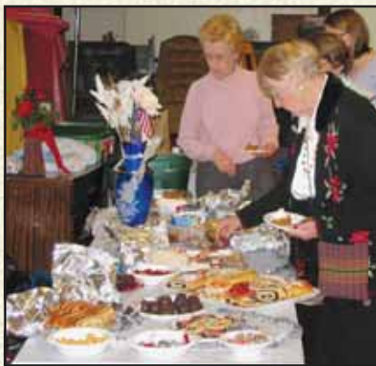
At the dessert table.