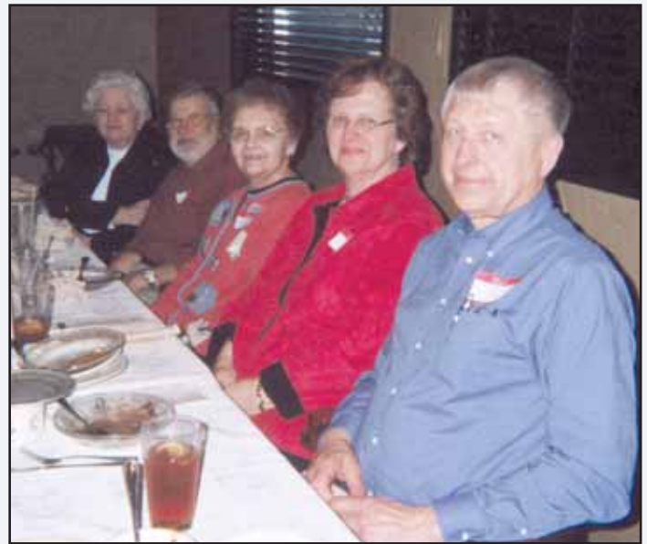
St. Isidore District officers were special guests.