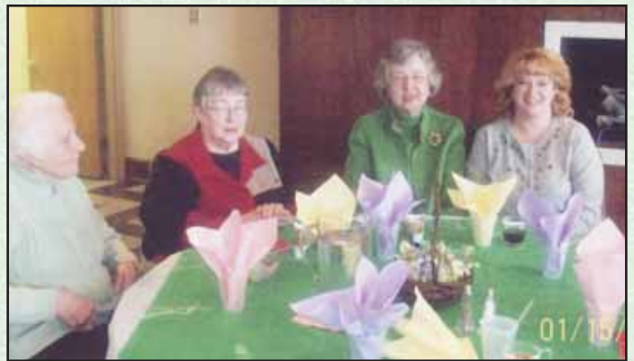
Members of Gary branch.