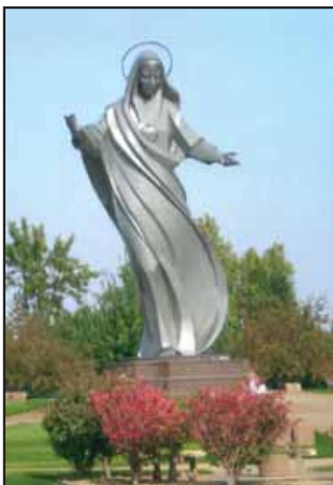
The 100-acre site is dominated by three story sculptures of Mary and Jesus.

After celebrating Mass at St. Joseph Church, located two miles from Trinity Heights, the group arrived at Trinity Heights. The first order of business was to enjoy a sack lunch and soft drinks on the patio outside the Marian Center before the tour which began with a film of the history and development of Trinity Heights. The three major works of art – a 33