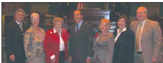
National Officers in Senate chambers with the now late Lt. Gov. Kathryn Baker Knoll.