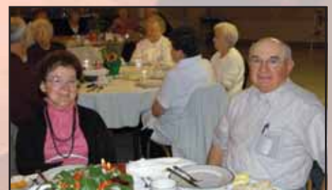
Members enjoyed a great meal and each others company at the recent District Meeting.