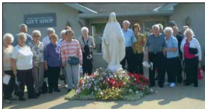
The Branch W018 pilgrims pose for a group picture before heading back to Omaha.

foot statue of the Scared Heart of Jesus, a 30 foot statue of the Immaculate Heart of Mary Queen of Peace and a hand carved wood sculpture of the Last Supper – were the focal points of the tour. In addition, members also enjoyed the Trinity Gardens, the Way of the Saints, the Stations of the Cross, the Beatitudes, and the Shrines to the Blessed Virgin. All these sites offered the members the opportunity for prayer and meditation. The day ended upon a safe arrival back in Omaha.