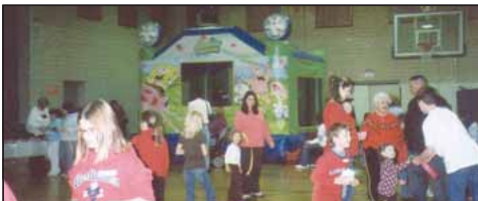
The members enjoyed bouncing in the Sponge Bob Bounce-A-Round.