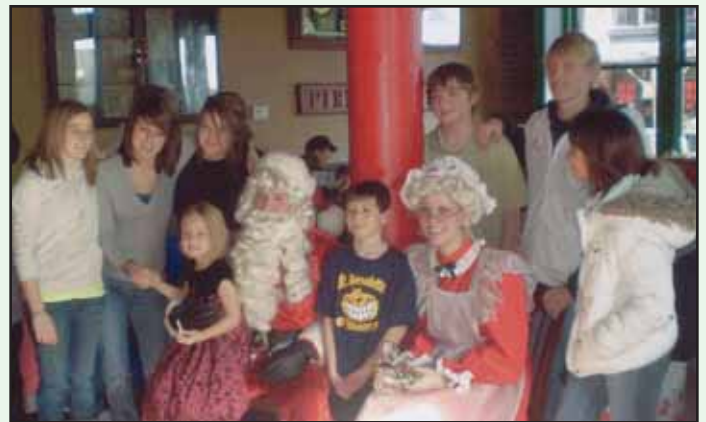
The Claus's and some BELIEVERS.

The afternoon concluded with a gift-wrapping session. Members of all ages got involved and soon a vanload of gifts was ready to be delivered.