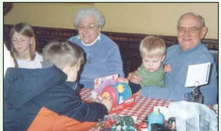
Grandparents were special invited guests.