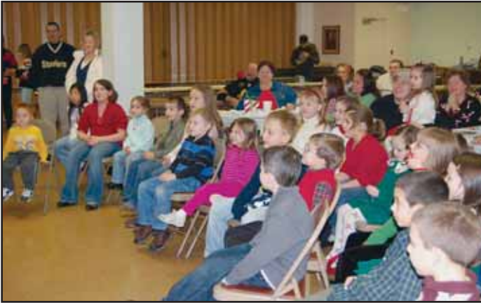
Children enjoy magician.