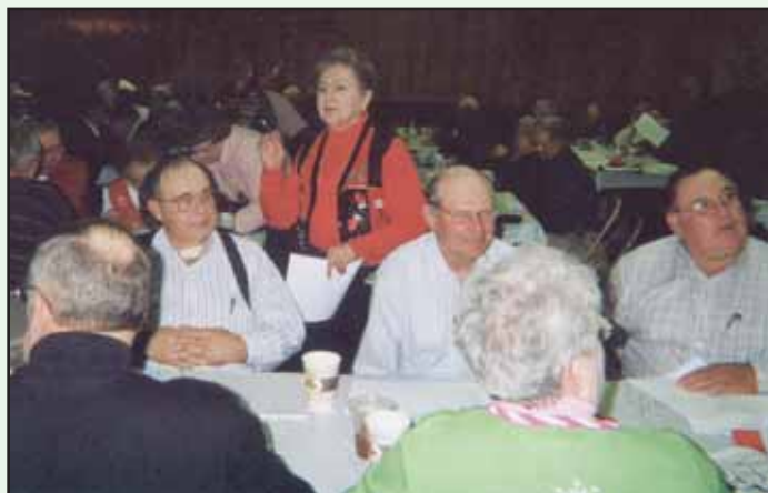
After dinner games stressed teamwork and Christmas knowledge.

Entertainment consisted of table teams competing for prizes based on their knowledge of Christmas and its many traditions. Caroling concluded the evening festivities.