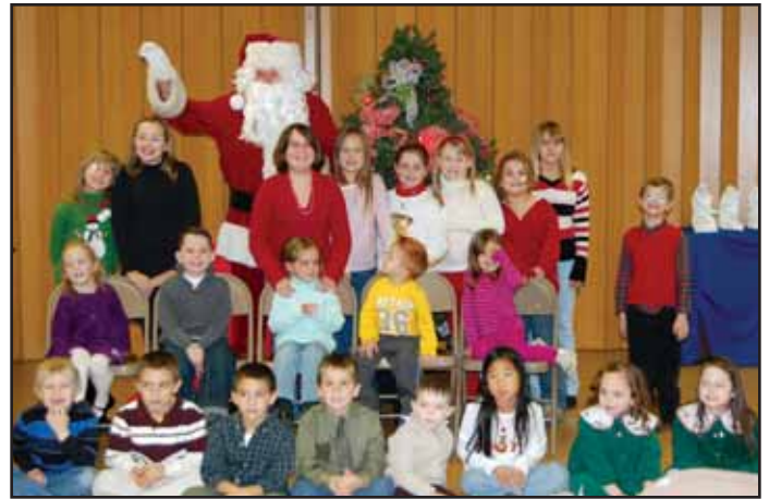
Some of the children with Santa.