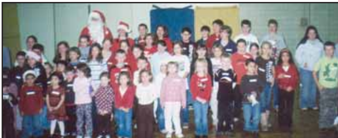
Jr. Branch members take a photo with Santa at their annual Christmas party.

All those in attendance remarked that the party gets better and better every year.