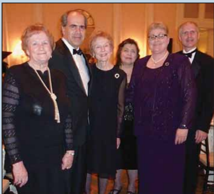
Some Members of the National Board of Directors are pictured with Slovak Ambassador to the U.S. Peter Burian.

peaceful demonstration in the old city center. This is believed by many Slovaks to be a point that gave birth to later events of a much grander scale in the country. Though official media ignored the event, Slovaks learned of it through word of mouth and reports picked up from Austrian media. A similar protest of a larger group of Czech students and young people gathered in Prague on the next day, November 17, 1989. Their peaceful march was brutally suppressed by the police and security forces. Powerful images of young people beaten by police sent an immediate shock wave through the country and ignited an unprecedented solidarity. The squares of all major cities in the Czech Republic and