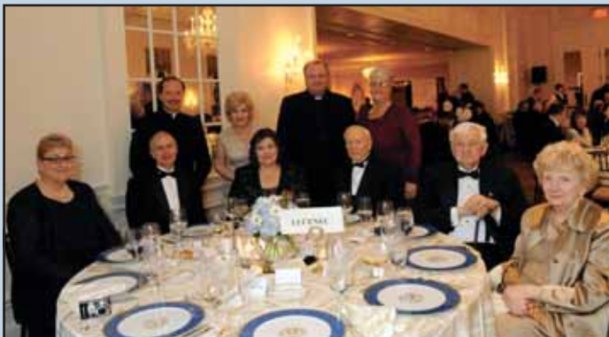
Members of the FCSLA Board along with Fraternal friends at the Lucenec Table.