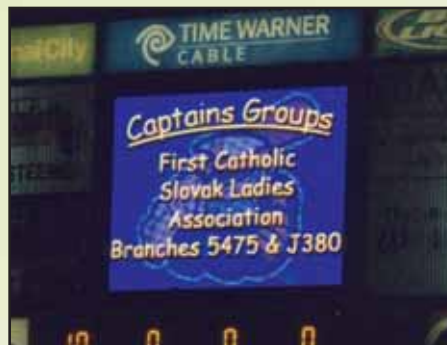
Jumbo Tron Message S475 and J380.