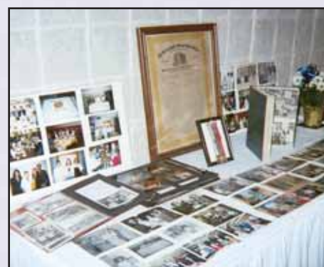
Display of past events of Branch 289.