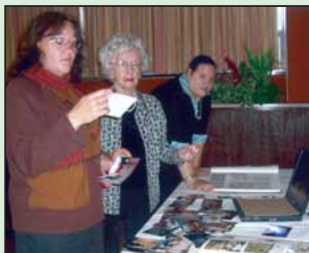
The Bealieu ladies.