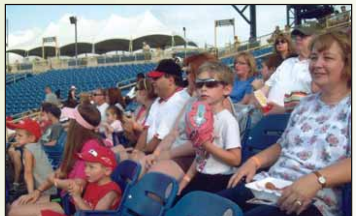
Jr. Branch 380 and Sr. Branch 475 members.