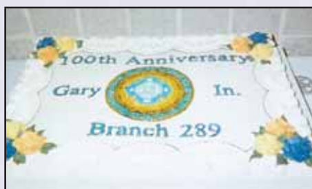
Cake with the FCSLA emblem.