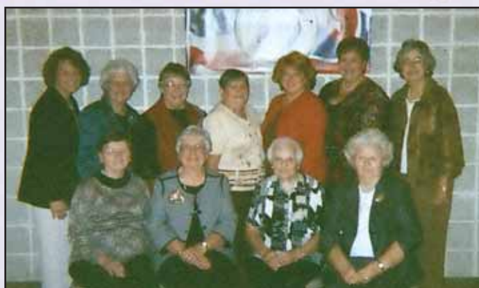
Officers of Branch 289 and 184.

Music was played during our luncheon and everyone enjoyed themselves on this day. Almost everyone said, they can't wait until our next anniversary.