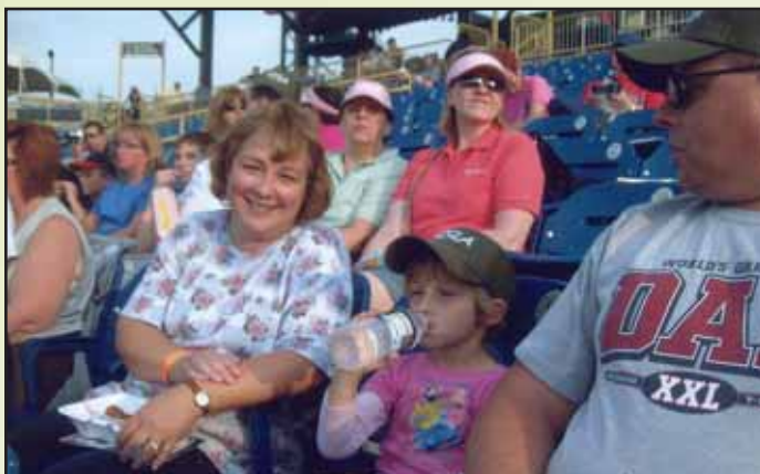
Jr. Branch 380 and Sr. Branch 475 members.