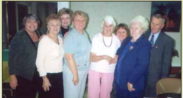
Some of the many FCSLA members in attendance.