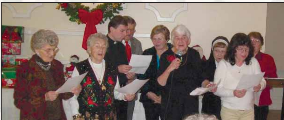
Various members and branch officers leading the attendees in singing Slovak Christmas Carols and other holiday songs.