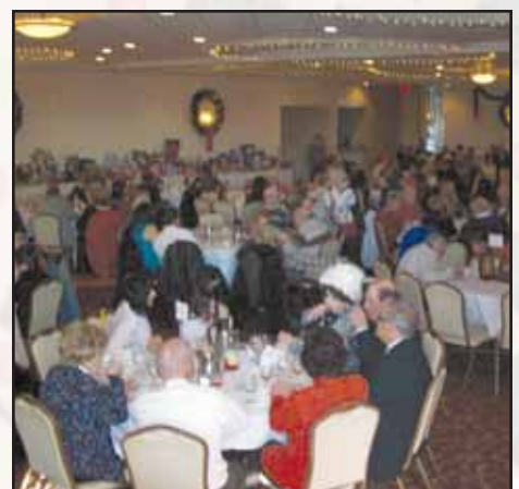
— Scenes at the Orland Chateau —