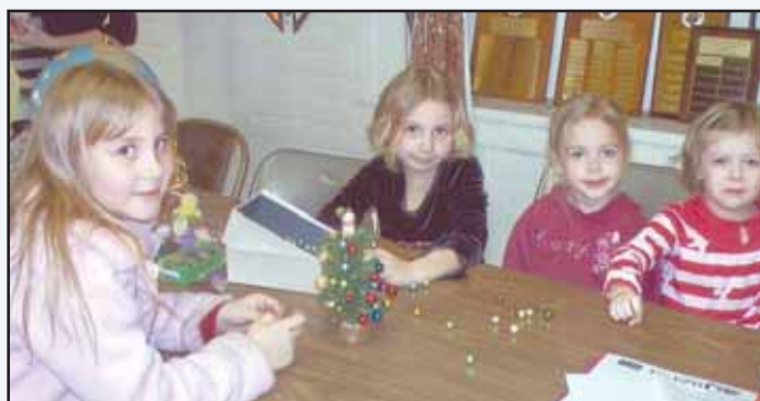
A good time that was had by all.