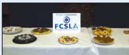
Sweet table at the luncheon with goodies baked by members of the St. Julie Billiard's Senior Young of Hearts Club.