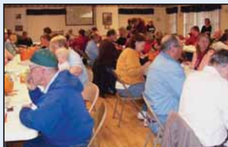
Brainard Community members enjoying 4 different soups.