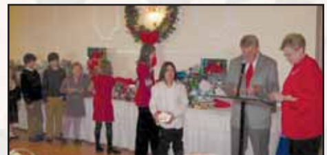
Jr. Branch members waiting to pass out the raffle prizes to winners.