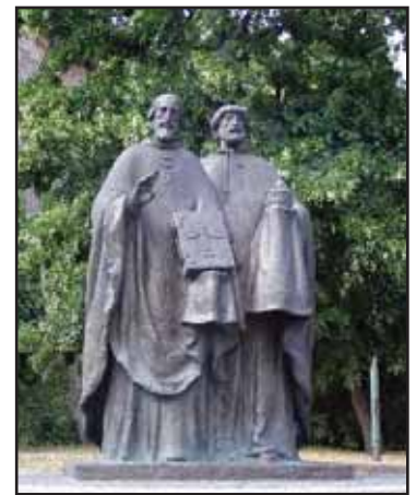
Statue of Saints Cyril and Methodius at the foot of Nitra Castle in Slovakia.

Saints Cyril and Methodius, watch over all missionaries but especially those in Slavic countries. Help those that are in danger in the troubled areas. Watch over the people you dedicated your lives to. Amen