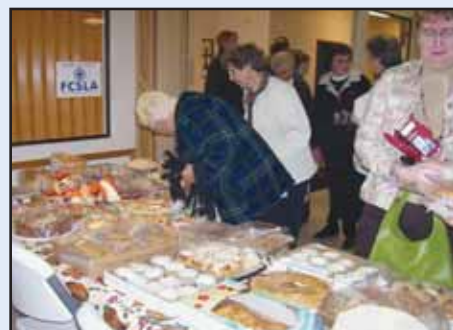
Baked good was offered for sale.