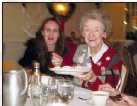
Some of the attendees.