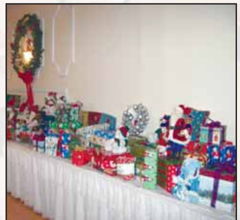
Above photos include branch officers setting up the raffle prize table, and all the beautifully wrapped prizes ready for the drawing.