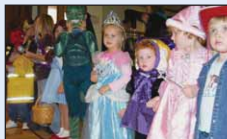
Halloween costumes paraded by the children during the FCSLA soup supper.