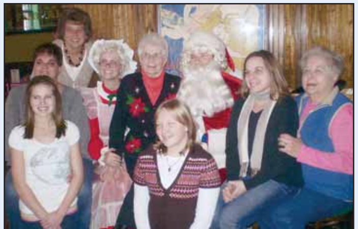
After all the junior members told the Clauses what they would like for Christmas, families were invited to take photos with the North Pole visitors.