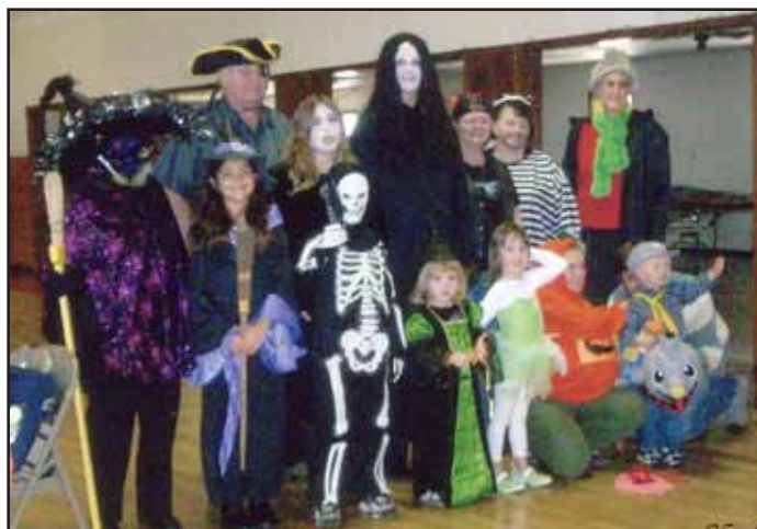
October 25, 2009 — Halloween Party