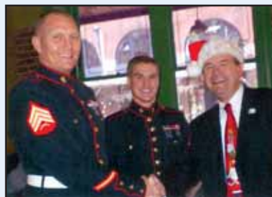
Representatives from the Omaha-area "Toys for Tots" received a monetary donation and hundreds of toys from branch members.