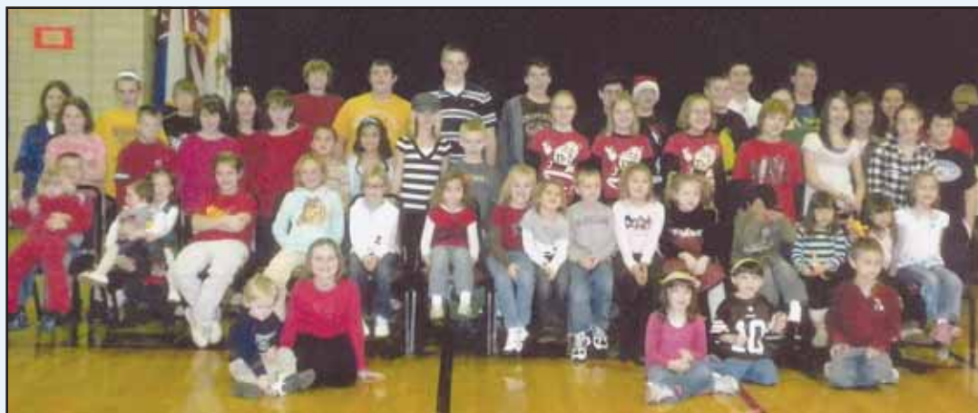
November 28, 2009 – Jr. Branch 192 Children's Christmas Party at St. Matthias Parish Hall, 68 children and 64 adults in attendance.