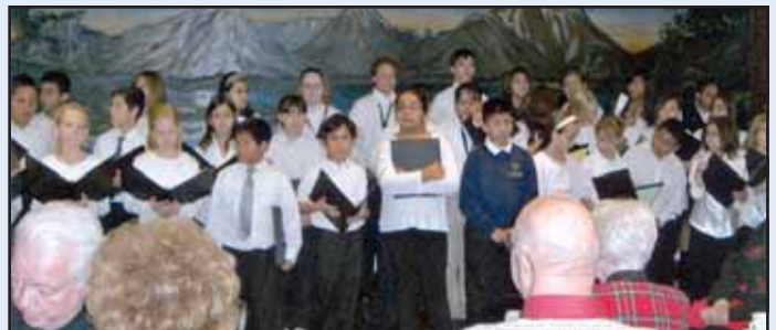
The St. John School Choir.