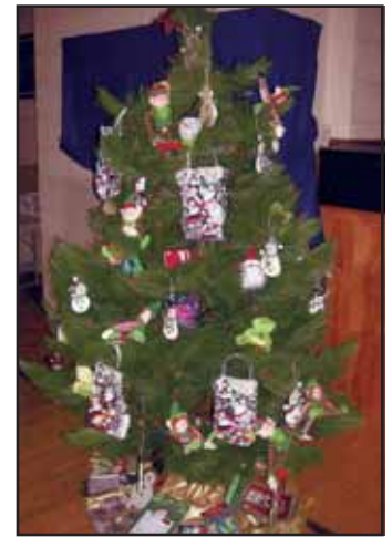
Bingo gifts on and under our Christmas tree.

During the meeting Santa Claus arrived. He handed out scholarships, took pictures with the children and gave out bags of treats for everyone attending. After the meeting door prizes were given out and bingo was played with prizes to pick from on and under the Christmas tree.