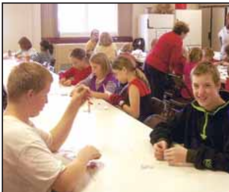
FCSLA junior members working on crafts for Christmas during the meeting.