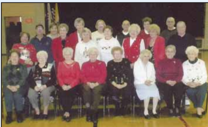
Members of St. Elizabeth Sr. Branch 161 pose for a group photo at their annual Christmas party.