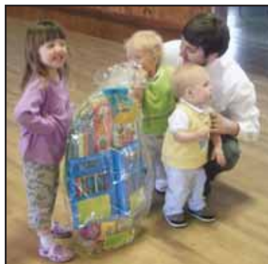
April 19, 2009 — Easter Party