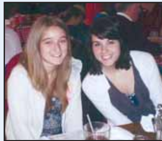
Branch W018 Junior members and their families had a fun Sunday afternoon.

FCSLA families brought new toys for "Toys for Tots" and non-perishable food items for "Operation Others," a project spearheaded by the local Catholic high schools to provide food for the less fortunate. After lunch and presentations, the Claus family from up North brought good cheer and bags of goodies for each junior member.