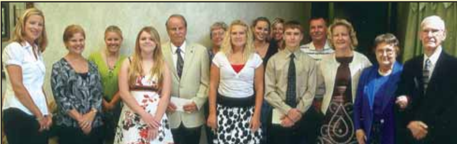
Scholarship winners, family members and officers of Jr. Branch 115 and Sr. Branch 177, Clairton, PA.