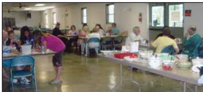
August 2, 2009 — Annual Picnic