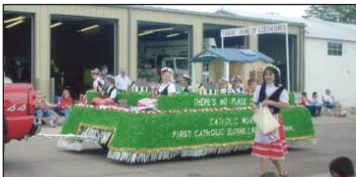
June 19, 2009 — Annual Czech Days. The FCSLA Float won second place in their division in the parade.