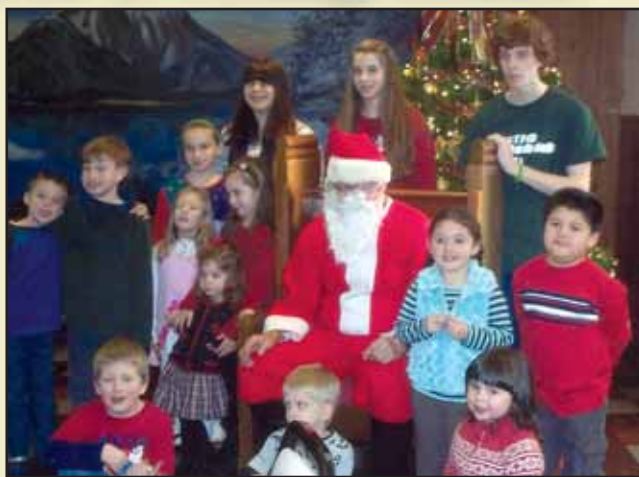
Santa with Jr. Branch 58 members.

All the good boys and girls received some goodies from jolly old St. Nick's bag. They all enjoyed a chat with Santa and a picture too. All the children were able to pick out a gift from the present table courtesy of Jr. Branch 58. All of our good boys and girls went home with full tummies, many goodies, and great memories thanks to all who participated.