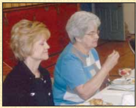
Officers at head table enjoy the annual event.