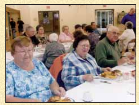
Guests enjoying a delicious brunch made by St. John Neumann School students and parents.