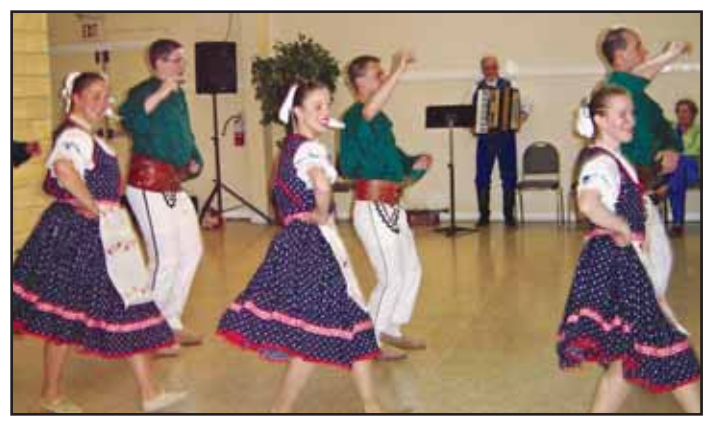
PAS dance at Slovak Cultural Garden, FL.