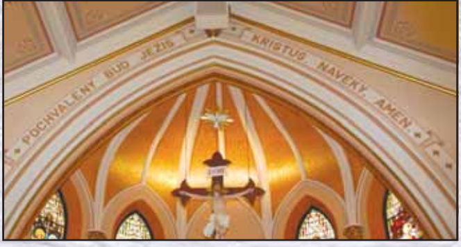
Interior Slovak Greeting at St. Katharine Drexel Church, Lansford, PA where the opening liturgy was held.