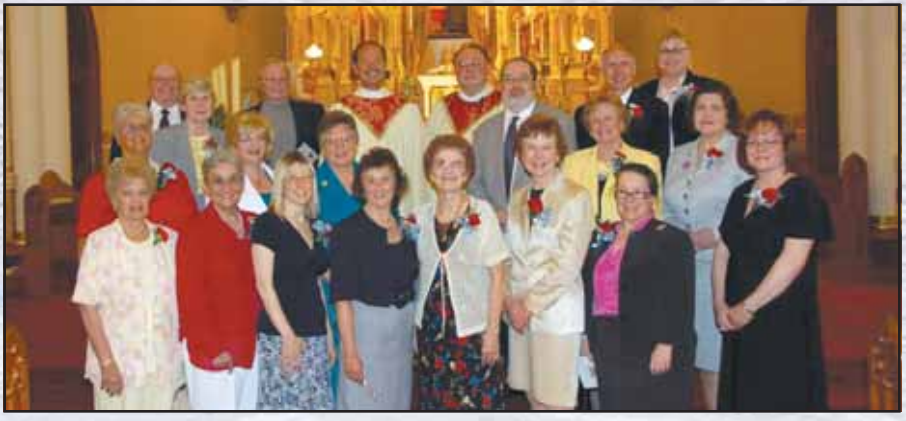
National Officers and Guests with District Officers after Mass at St. Katharine Drexel Church, Lansford, PA.