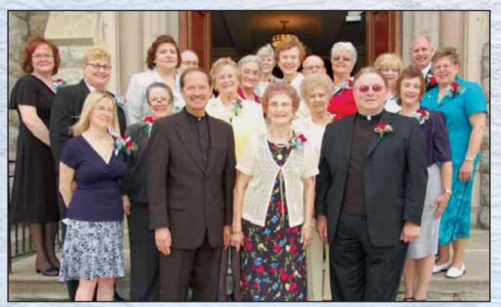
District Officers, National Board Members and their guests gather on the steps of St. Katharine Drexel Church in Lansford prior to the opening liturgy.