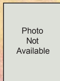
Photo Not Available