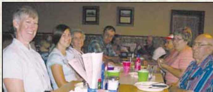
Candid shots from Branch W133 members and families gathering for lunch.