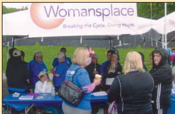
Staff, family and friends of Womansplace.