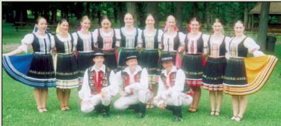
The Šarišan Slovak Dancers from Sterling Heights, MI headlined the entertainment portion of the day.

The Sarisan Slovak Dancers from Sterling Heights, MI, provided the headline entertainment, while the Gene Mikrut Orchestra from Chicago played dance music for the rest of the afternoon. Delicious Slovak baked goods and raffle tickets were sold by festival volunteers. It was another wonderful Indiana Slovak Day!