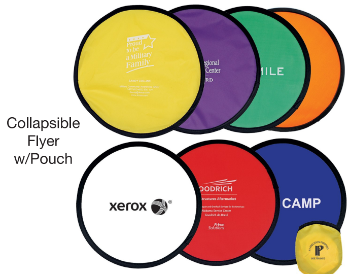
Collapsible Flyer w/Pouch