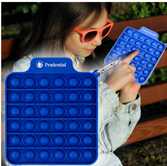
Fiddle Popper Toy