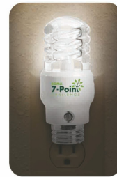
Compact Fluorescent Nightlight