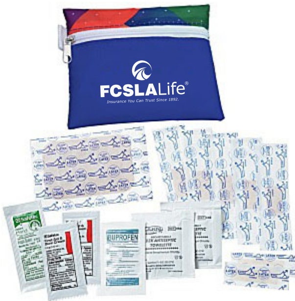
Mini First Aid Kit

Questions about giveaways? Contact giveaways@fcsla.com or (800) 464-4642 x1080.