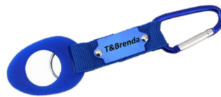
Carabiner w/Water Bottle Holder