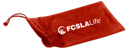
Microfiber Glasses Pouch