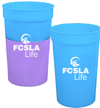
22 oz. Color Changing Cup