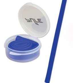
Reusable Silicone Straw

We still have many giveaways in stock from previous years. Giveaways may be requested from this list as well. Limited quantities.