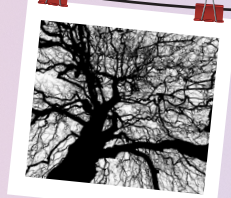
BLACK & WHITE PHOTOGRAPHY