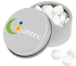
Mini Round Mint Tin