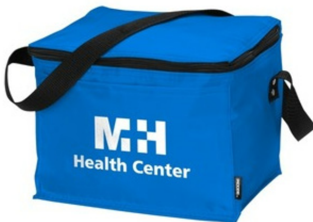
Koozie Insulated Bag