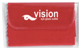
Glasses/Screen Cleaning Cloth