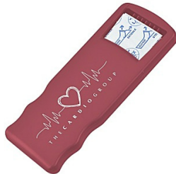
Metallic Bandage Dispenser