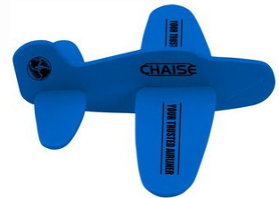
Foam Airplane Flyer for Children