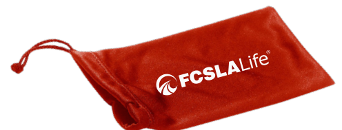
Microfiber Glasses Pouch