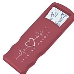
Metallic Bandage Dispenser