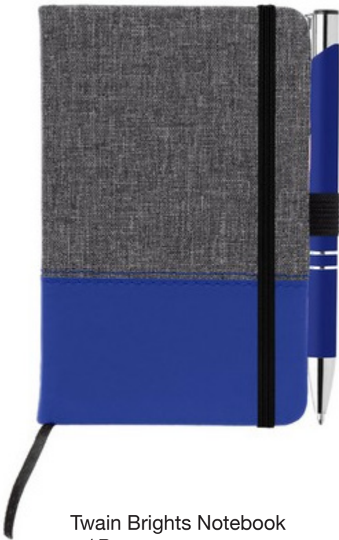
Twain Brights Notebook w/ Pen