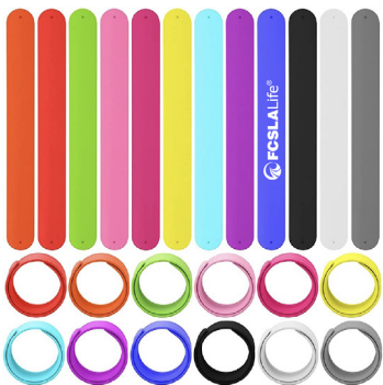
Slap Bracelet (Junior)