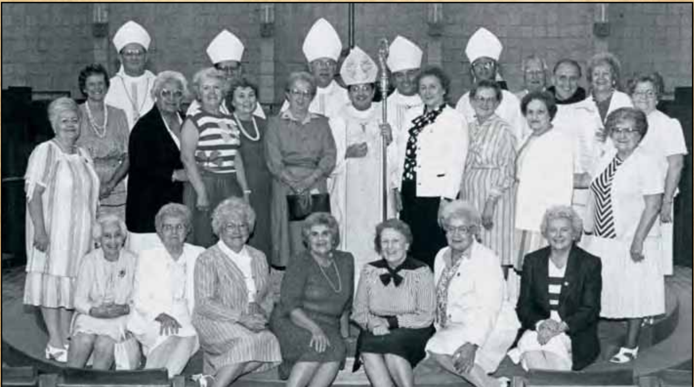
National Board members, branch officers, members, and clergy pictured at the dedication of the Abbey Church under the title St. Andrew Svorad, Cleveland, Ohio, August 19, 1986.