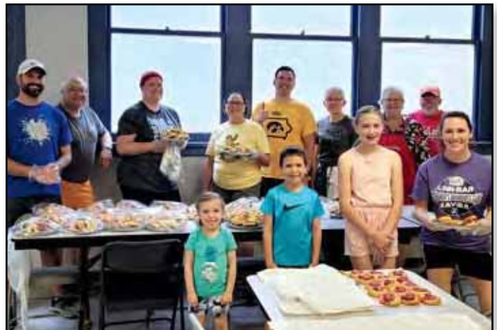
FCSLA W137 members/kolach bakers with the freshly baked and packaged kolaches to be delivered to golf tournament sponsors.