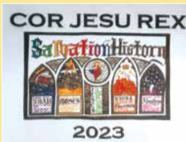
Left: Logo for Summer School CCD at Sts Mary & Joseph Church, Valparaiso, NE. Logo was printed on T-shirts for all attendees sponsored by Branch 187.

Branch W187, Valparaiso, NE supports two Catholic Schools - Bishop Neumann Junior & Senior High School and St. John's Elementary School as well as Sts. Mary & Joseph Summer CCD program. This year the branch sponsored t-shirts for all students, many of whom are FCSLA Life members, during CCD week.