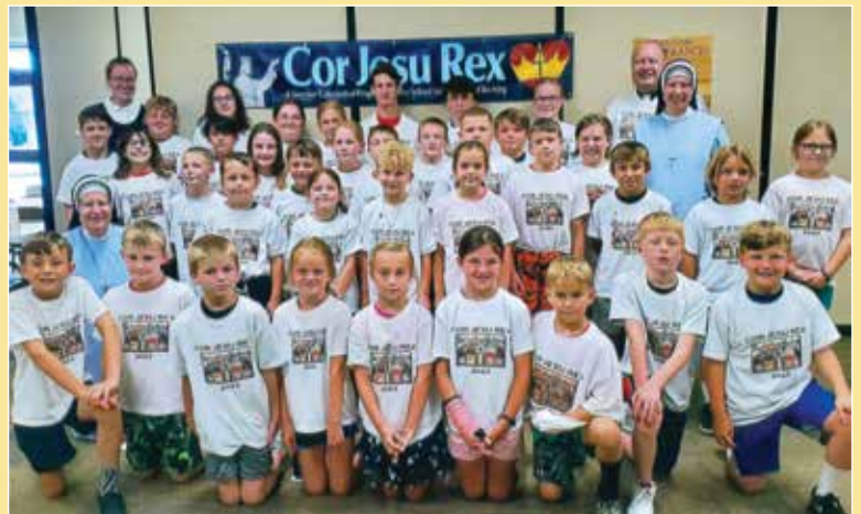
Valparaiso, NE Summer CCD attendees wearing their T-shirts sponsored by W18