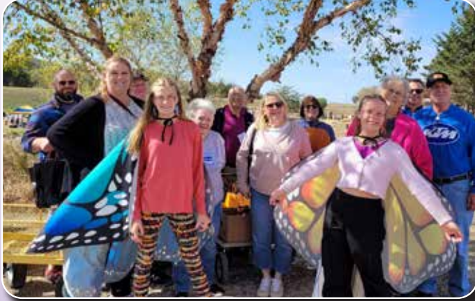
FCSLA members gather to receive treat bags before selecting their pumpkins.

On Sunday, October 8th, FCSLA Branch W137, Cedar Rapids, Iowa held its annual Family Fall Festival at Bass Farm, Mount Vernon. Members enjoyed the farm's activities, including a corn maze, hayrack ride, mini golf, giant slide and many others. Everyone took home pumpkins from the pumpkin patch and a treat bag.