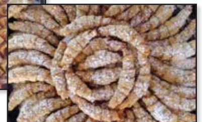
Homemade nut horns