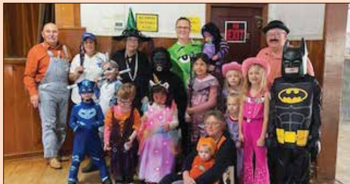
Members of Branch W093 Tabor SD, are pictured at their October 2023 meeting.