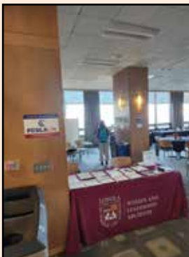
FCSLA sign at entrance