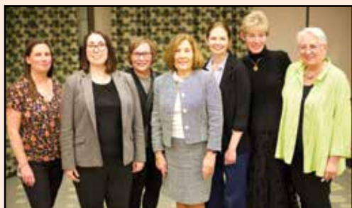
2023 Women & Leadership Archives