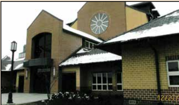
St. Wenceslaus Church, the Czech Mother Church of Nebraska, dedicated its newest Church in July 2021. The new building is the largest Catholic Church in Nebraska, and the parish school is the largest Catholic school in the state with over 900 students.

Following the meeting members enjoyed houska, kolaches, homemade caramel corn, and Christmas cookies.