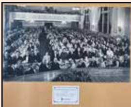
HQ Dedication Banquet

Each guest received a “goody bag” and both a gift raffle, featuring items made in Poland and a cash raffle were held. Refreshments, which included delicious Polish “kanapki” and beverages were underwritten by Branch Z-211.