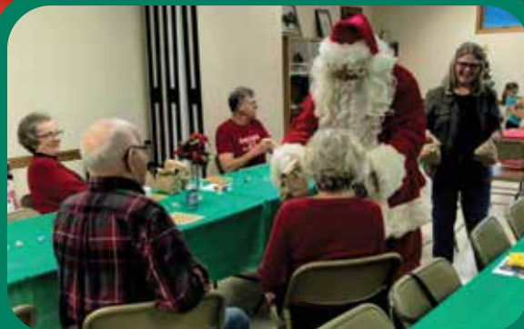
Santa visiting and distributing treat bags to members