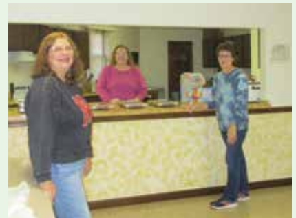
W16 and Community Club members getting ready for the brunch.