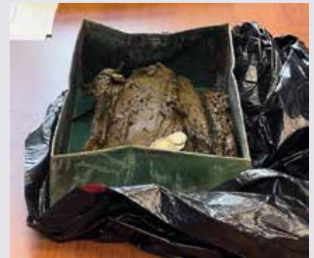
Contents of the church cornerstone suffered severe water damage due to the cornerstone's position in the church wall.

In August the city decided to raze the abandoned church and the school, and this news raced through the internet at light speed. The church and school had sat