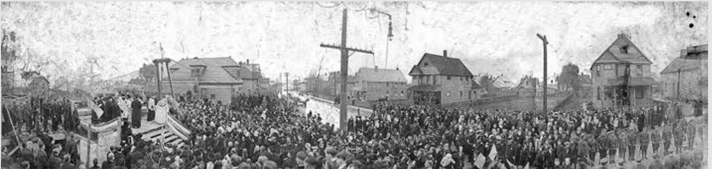
A crowd of about 2000 filled Aetna Road and surrounding properties to celebrate the laying of the cornerstone of Nativity BVM School, November 14, 1915.