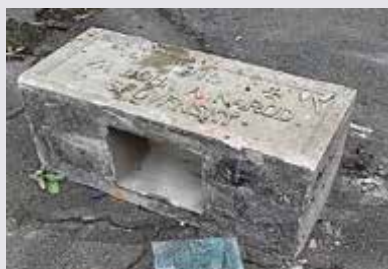
The school cornerstone has been saved and will eventually be placed in the Slovak Cultural Garden in Cleveland.

We found published lists of contributions of parishioners from 1924 along with parish news for that year along with Slovak and English newspapers containing articles about the cornerstone laying.