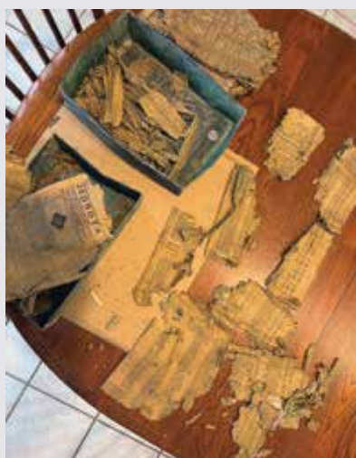
Contents of the church cornerstone consisted of several English and Slovak newspapers plus a parish financial report, but all were victims of water damage.