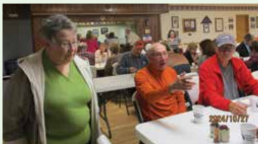
Community members and guests enjoying the brunch