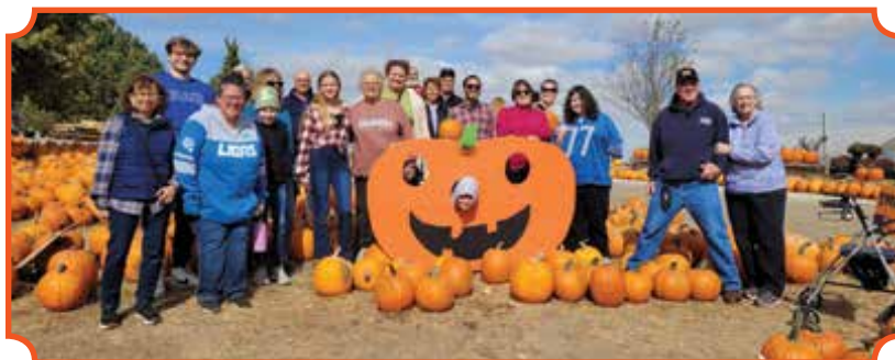
Members gather around the pumpkins for a group photo.