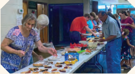
Tables filled with picnic food.

FCSLA Life Branch W187 (Valparaiso, NE) held their annual picnic on Wednesday, June 18, 2025 following Mass. Due to stormy weather the event was moved from the park to the church hall. After a delicious meal, local scholarships were presented to members. Ten members received local scholarships. Five members received national scholarships.