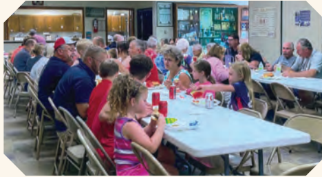
Some of the members enjoying the picnic.