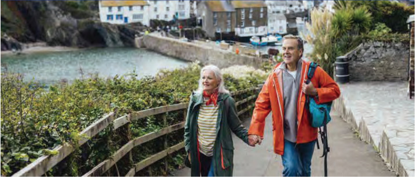
CHART YOUR COURSE