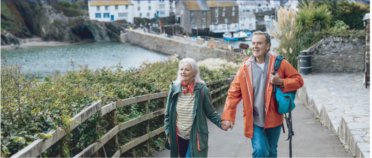
CHART YOUR COURSE