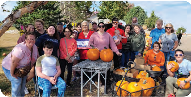
W137 members take time out from choosing pumpkins for a group photo.

FCSLA Life Branch W137 held its annual Family Fall Festival on a sunny Sunday afternoon, October 12th at Bass Farms in rural Linn County. Two dozen members enjoyed selecting pumpkins, taking hayrack rides, solving the corn maze and other outdoor activities.