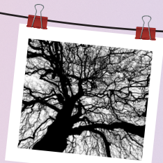
BLACK & WHITE PHOTOGRAPHY