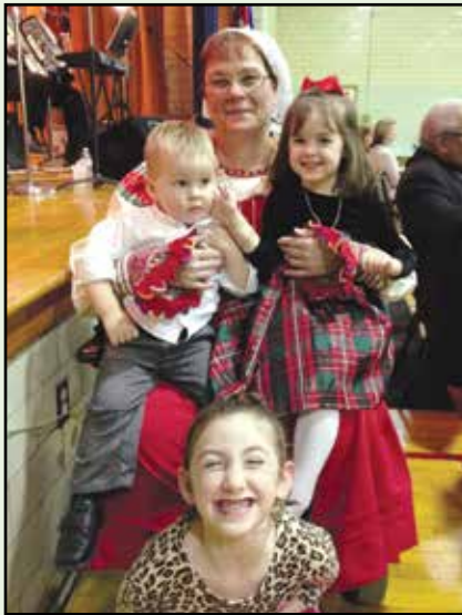
St. Matthias School 2016