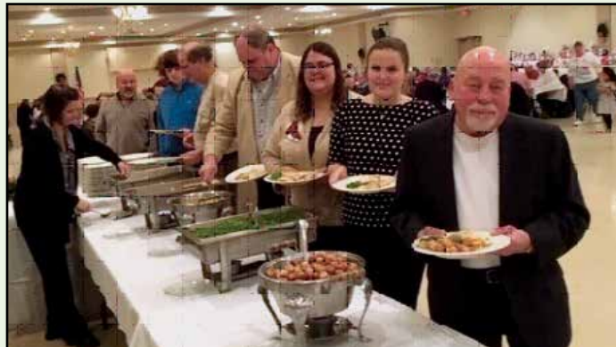
In 2019 the celebration was held at the Byzantine Center.