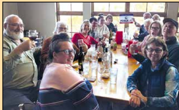
Branch W137 members offer a toast to "Na Zdravi" (Good health)!

FCSLA Life Branch W137, Cedar Rapids, IA, held its Adult Wine Tasting Event on Sunday, February 12, 2023, at Cedar Ridge Winery in Swisher, IA. Fifteen members enjoyed wines and wood-fired pizzas. There were four lucky winners of Cedar Ridge gift cards and all went home with a treat bag.