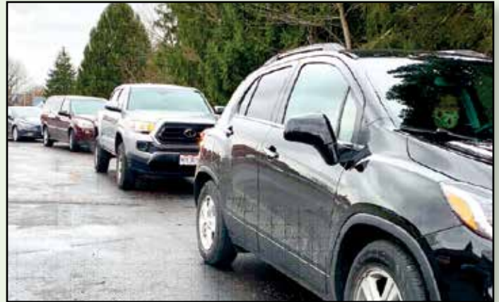
2020 drive-thru during the pandemic.

Parish, and the American Slovak Cultural Association) on Youngstown's south side, but most importantly it has survived and provided the traditional Slovak Christmas Eve meal for hundreds of Slovaks (and many other people!) helping to maintain our Slovak heritage for 50 years! Na zdravie!