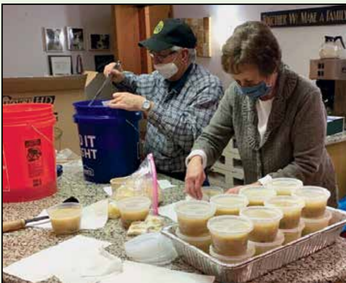
St. Matthias Parish House 2020.