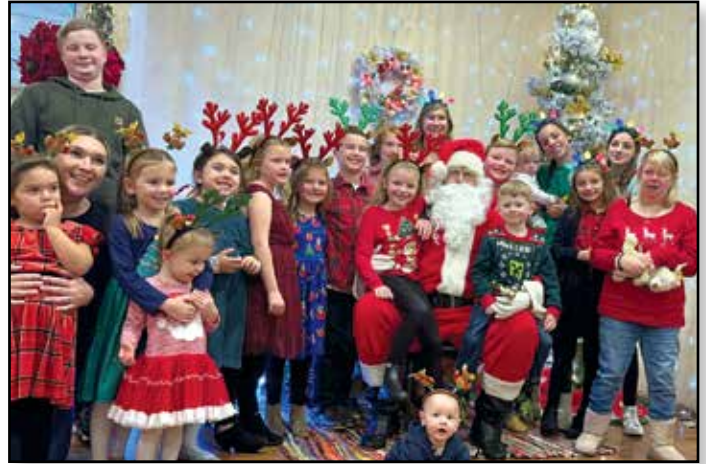
Santa Claus with all the children in attendance.