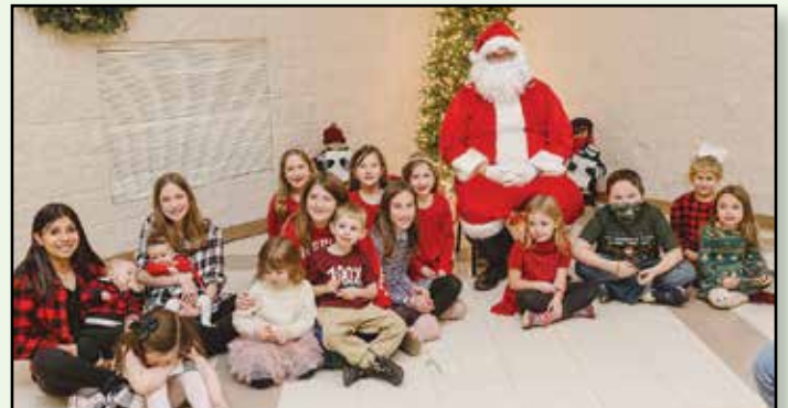
Members of Branch J317 attending the event.