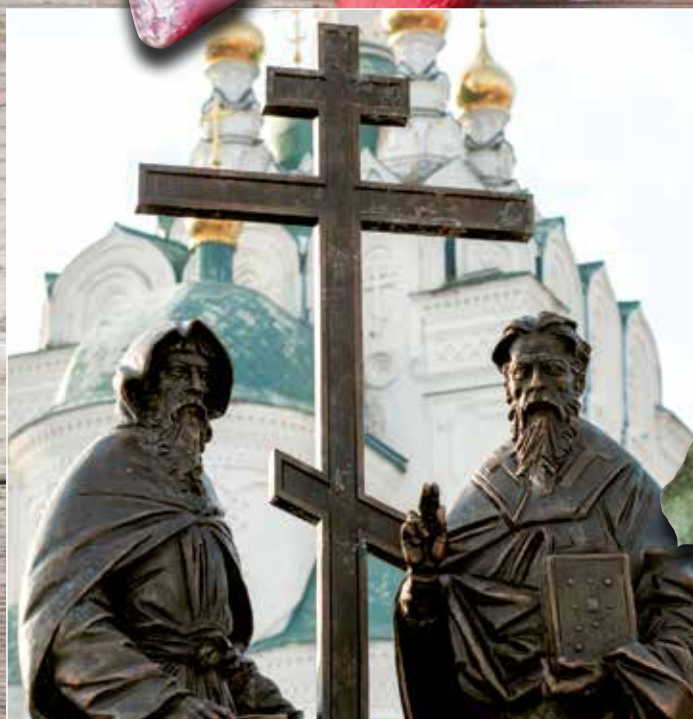
SAINTS CYRIL & METHODIUS FEAST DAY FEBRUARY 14