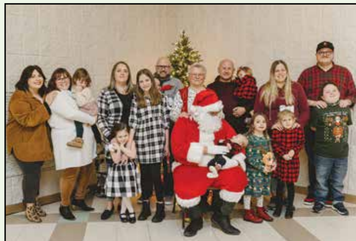
Chervenak family members of Branches S409 and J317.