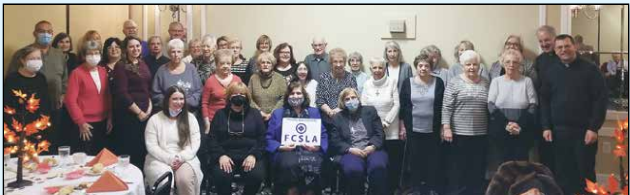
Some of the members attending pose for a pre-luncheon photo.