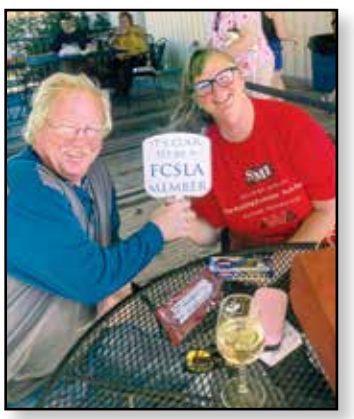
The Waters are proud to be FCSLA Life members of Branch W018.