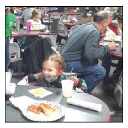
Members enjoying bowling and pizza.

On Sunday, December 5th, 2021, FCSLA Branch W137 held the Annual Family Christmas Party at Cedar Rapids Bowling Center. Members were treated to bowling, pizza, drinks and snacks. Everyone also received a Christmas gift bag with candy and FCSLA giveaways.