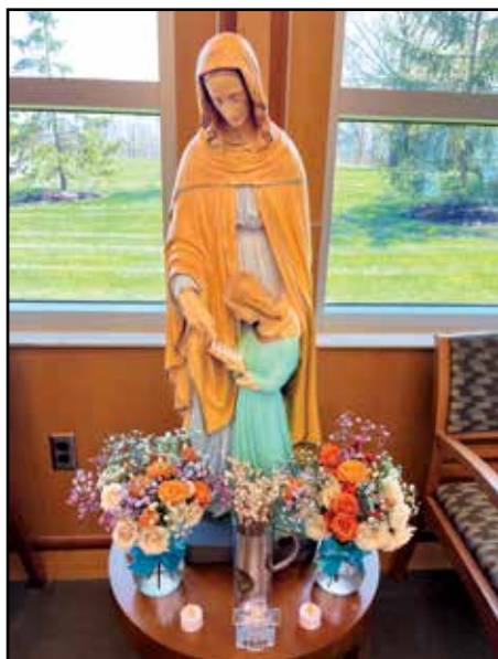
Blessed Virgin statue in board room of home office surrounded by flowers honoring Mary as "the Queen of May".

A May crowning ceremony was held at the Home Office during the annual District President's Meeting, on May 4, 2023. May is traditionally dedicated in a special way to honoring and seeking the intercession of Mary as the Mother of God and Mother of the Church.