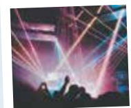
SPORTING EVENT OR CONCERT