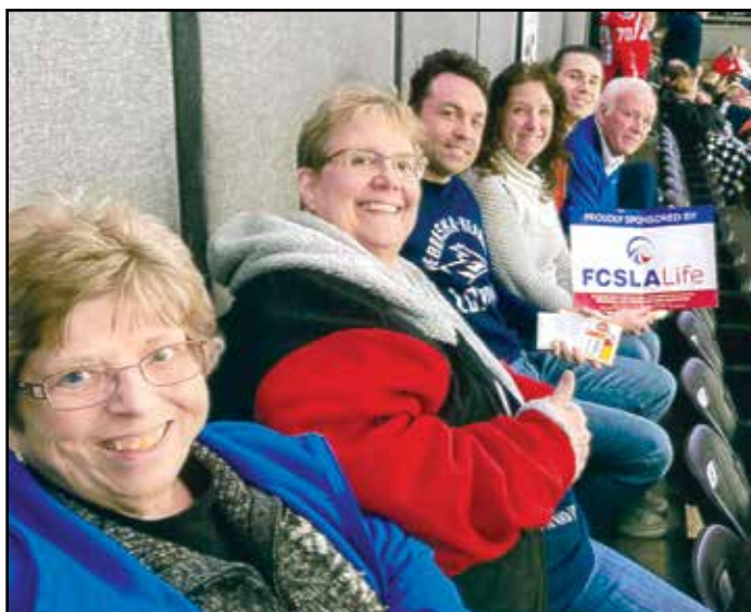
Part of the Branch W-018 group cheering on the Lancers and advertising FCSLA Life!