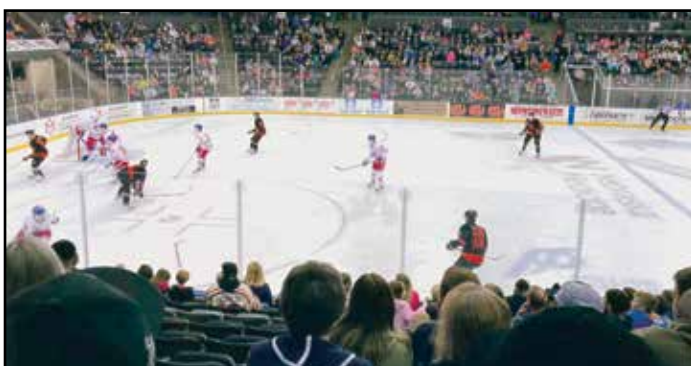
Action on the ice! Omaha Lancers in the black and orange try to score a goal.