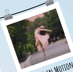
BODIES IN MOTION