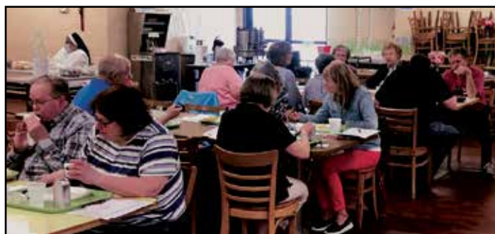
Cleveland district members enjoying the luncheon.