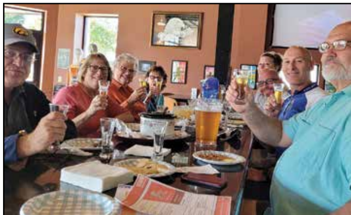
Members of W137 toast to our good health, Na Zdravi!!