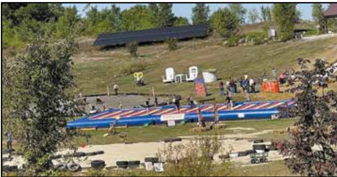
Everyone had fun playing the various games and activities.