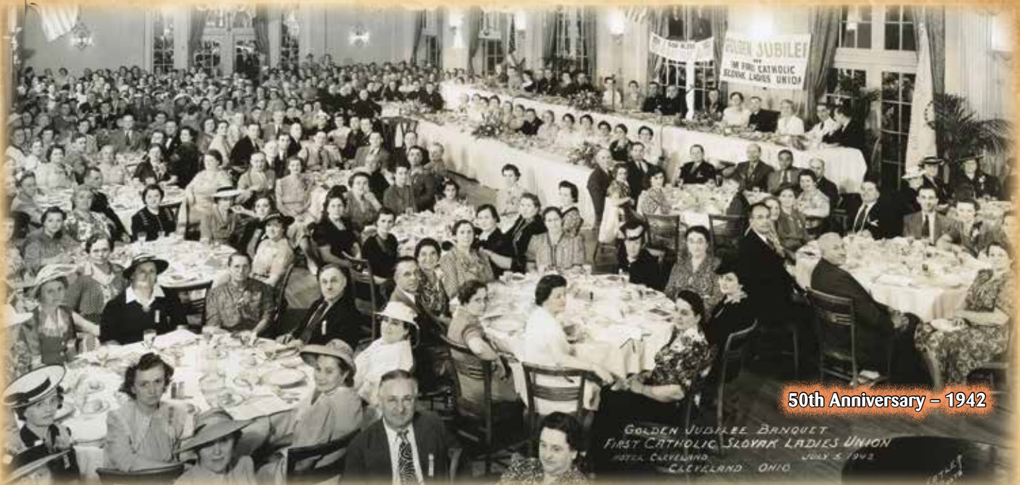
50th Anniversary – 1942