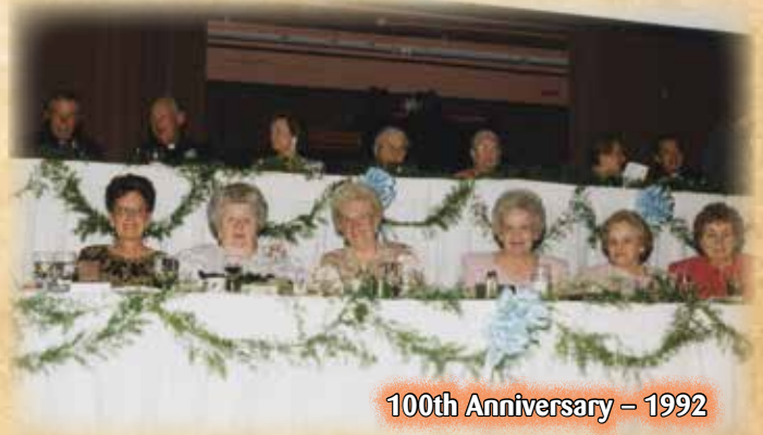
100th Anniversary - 1992