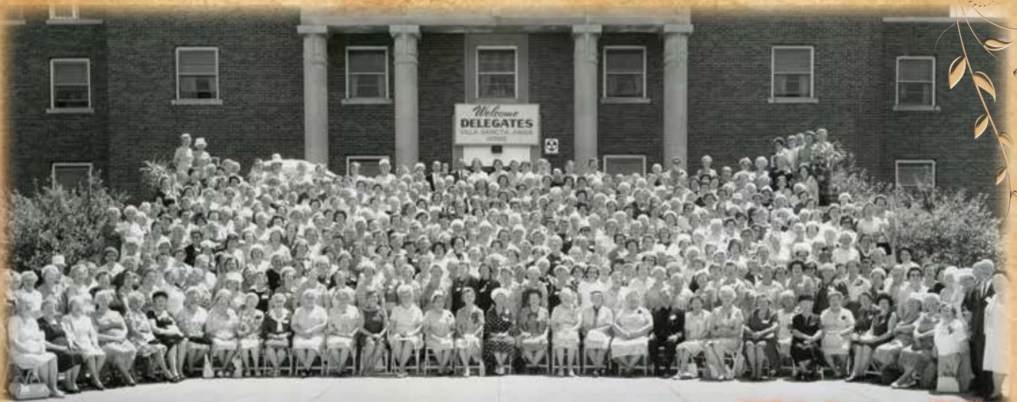
75th Anniversary - 1967