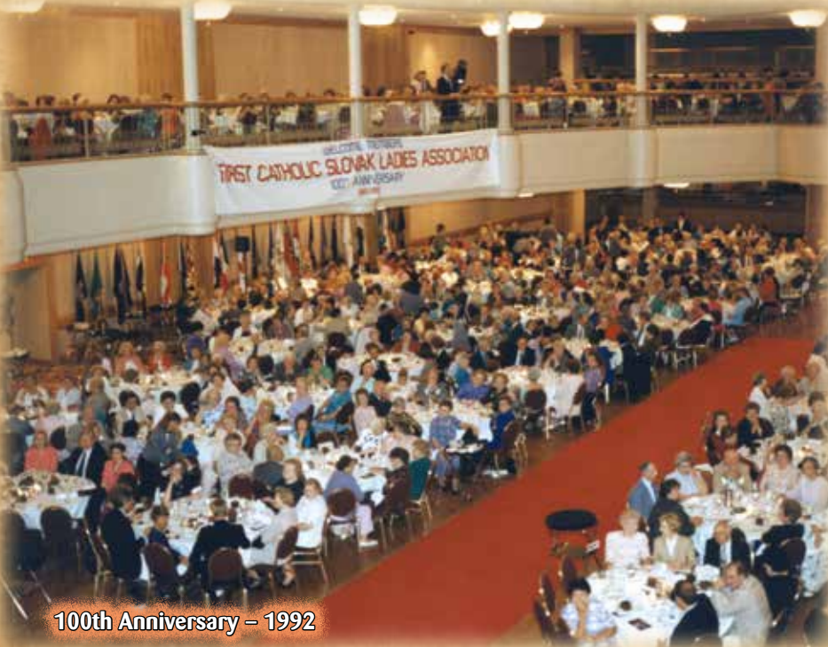
100th Anniversary - 1992