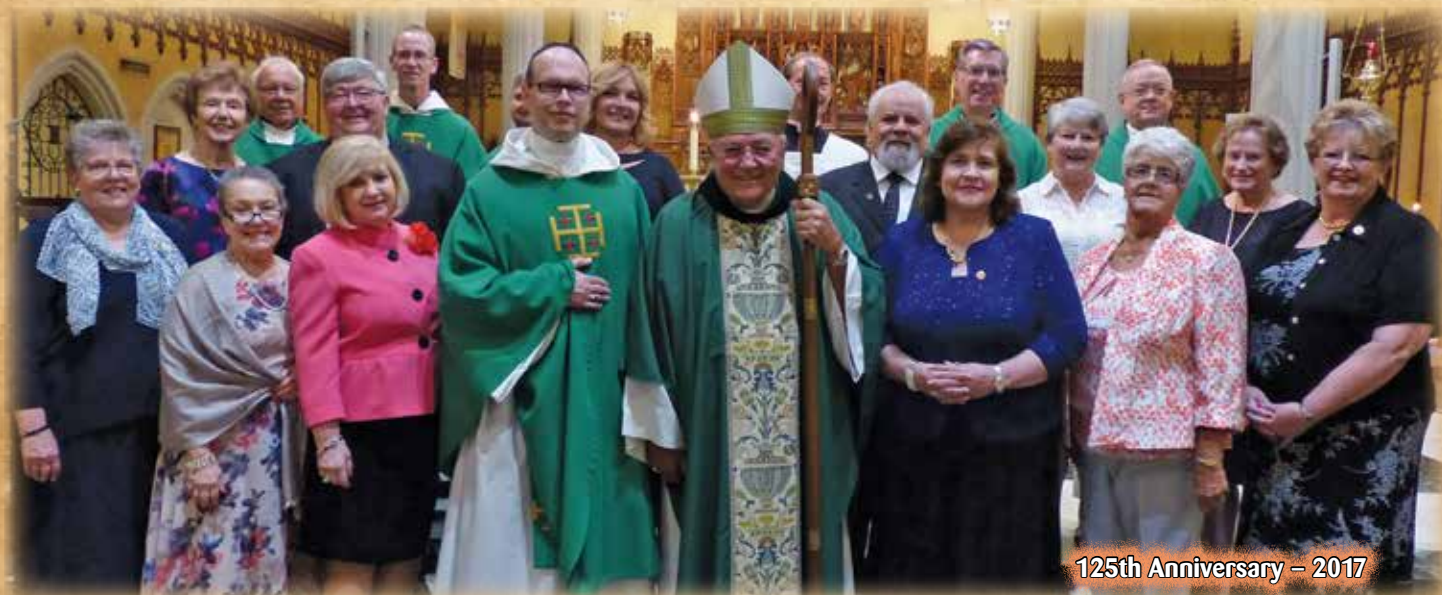
125th Anniversary – 2017