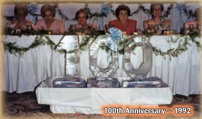
100th Anniversary - 1992