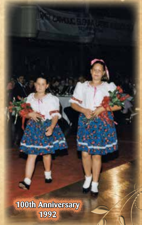
100th Anniversary 1992