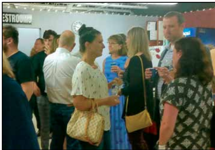
A group of supporters gathers to share stories and memories while enjoying snacks and beverages. They believe we, as humans, are all connected and even more so when engaged in the arts.