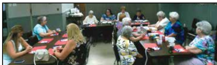
St. Ann's Lodge S114 and J198 Scholarship Luncheon attendees.