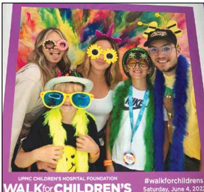
The Stover Family