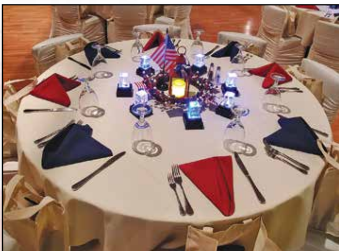
Pittsburgh District Meeting goes patriotic thanks to the officers of Branch S011.