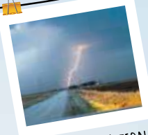
WEATHER IN ACTION