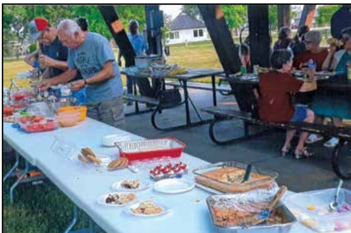
So much good food to enjoy.