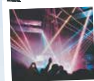
SPORTING EVENT OR CONCERT