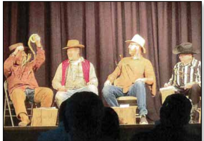
Members of the fun-raising committee.