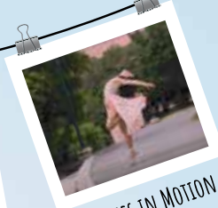
BODIES IN MOTION