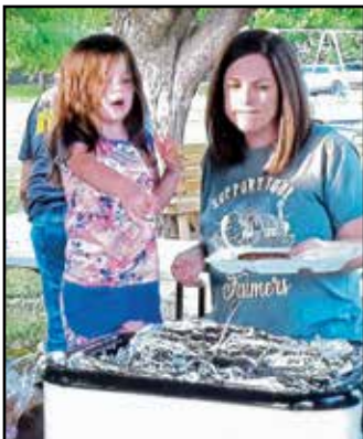
It's hard to decide – burger or brat?