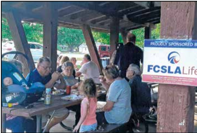
Members enjoying the food and conversation.

Branch W187, Valparaiso, NE recently held their adult fraternal activity. More than thirty members attended a picnic, where special guests, included seven new youth members. The branch also honored their scholarship winners.