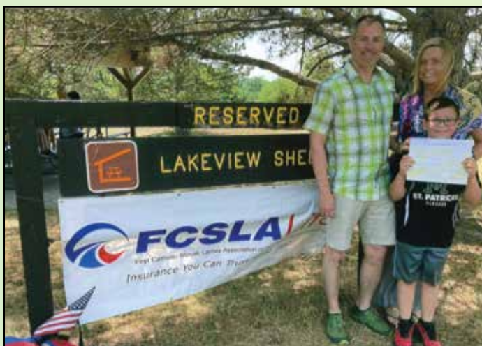
One proud Branch scholarship winner and his parents.