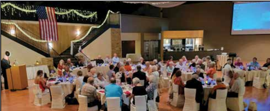
Patriotic theme at Antonelli's Event Center for the District Meeting.

Inc. in Oldsmar FL and Cotherman's Distillery in Dunedin FL for their donations. Once again, thank you for your unwavering commitment to the Wounded Warrior Project, and for making a difference in the lives of our brave heroes. Your generosity leaves a lasting legacy, fostering hope and resilience in those who have served our country with honor.