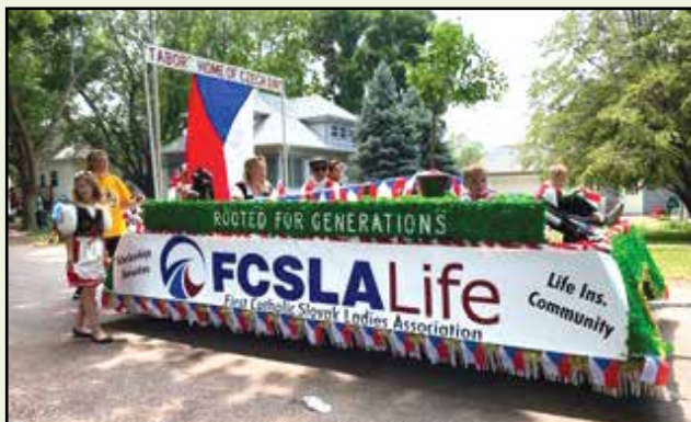
Branch W093 participated in Tabor, SD Czech Days celebration, June 16, 2023, "FCSLA rooted for generations".