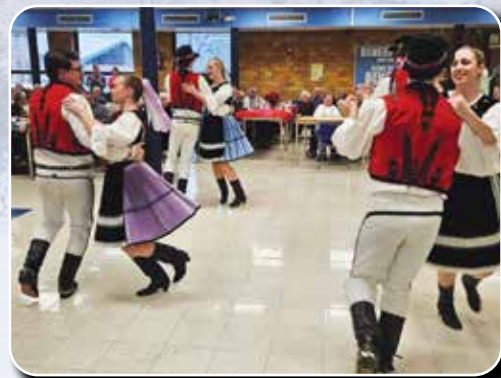
Dancers from Lucina Dance Troupe, who performed at the Vilija.