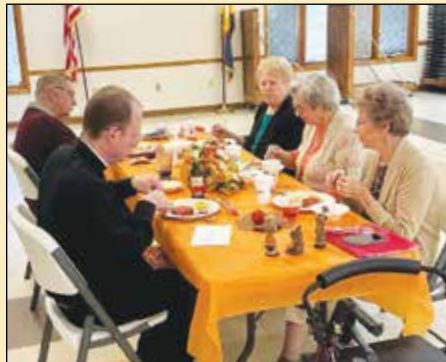
Brainard, Nebraska W16 dinner meeting members and guests