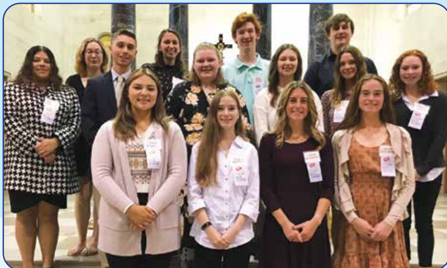
2023 recipients of the 2023 Servant Leadership Award