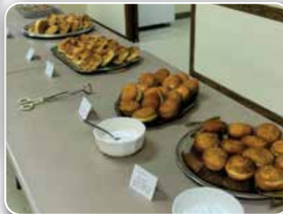
Kobliha, Kolaches & Zelnicky waiting to be enjoyed by members in attendance at the District 12 meeting.